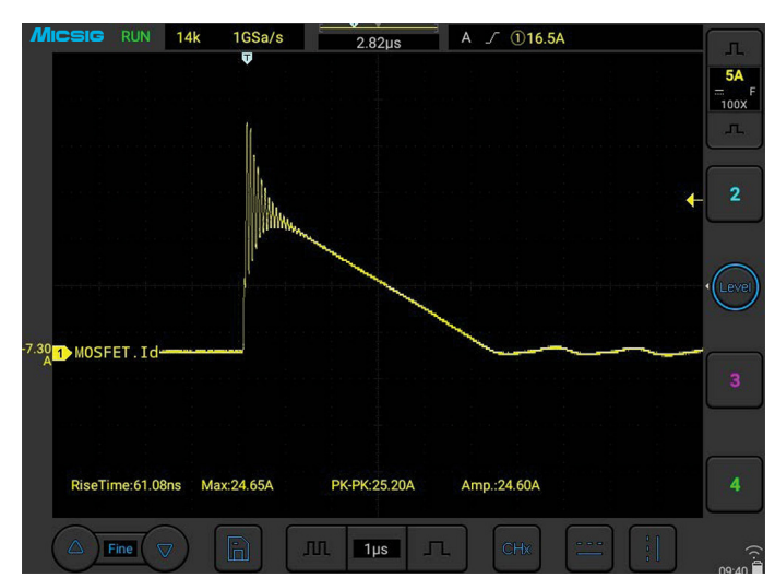
*The measurement in the above figure is carried out using RCP600XS.

Excellent high-frequency measurement capabilities, easily measures high-speed signals, able to observe HF harmonic components when measuring the Id current of MOSFET (as shown the oscillation section).