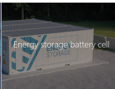
Energy storage battery cell