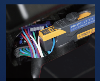
Compact, contactless, and high-accuracy

Multiple sensors can be easily installed, even in confined spaces and locations with complex wiring.