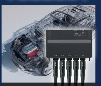
Extended measurement on battery power

Up to five sensors can be connected to a single current module. Wireless modules can operate on battery power for 5 hours or more.