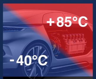
Broad operating temperature range

Multiple sensors can be easily installed, even in confined spaces and locations with complex wiring.