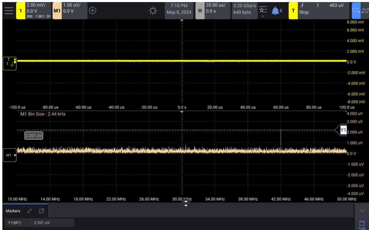
Figure 1. The oscilloscope captures a 2 \mu\text{V} , -100dBm signal very clearly in our FFT. This same signal would not be viewable with a higher noise floor oscilloscope.

You can achieve even greater accuracy (5x better) with up to 16 bits of resolution using the built-in bandwidth filters. Need to use the full bandwidth to 1 GHz? You will still get extremely high accuracy at the full bandwidth, with the ability to zoom to 500 \mu\text{V}/\text{div} .